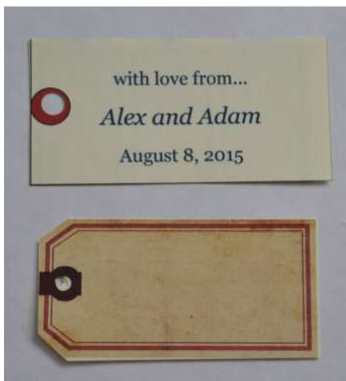
“Luggage” (top) Vintage (bottom)

Lettering in colour of choice except for on chalkboard tags. (examples only)